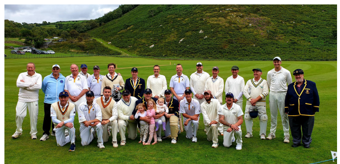
PCA cricketers on tour in England July 2023- some of the amazing venues: Sidmouth and Valley of the The Rocks