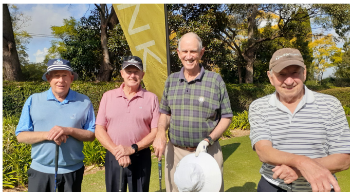
Photo highlights from the Killara Golf Day in August, including Mixed Team Trophy winners (2nd on left) and Perpetual Team Trophy winners at the foot of this page (2nd from right).