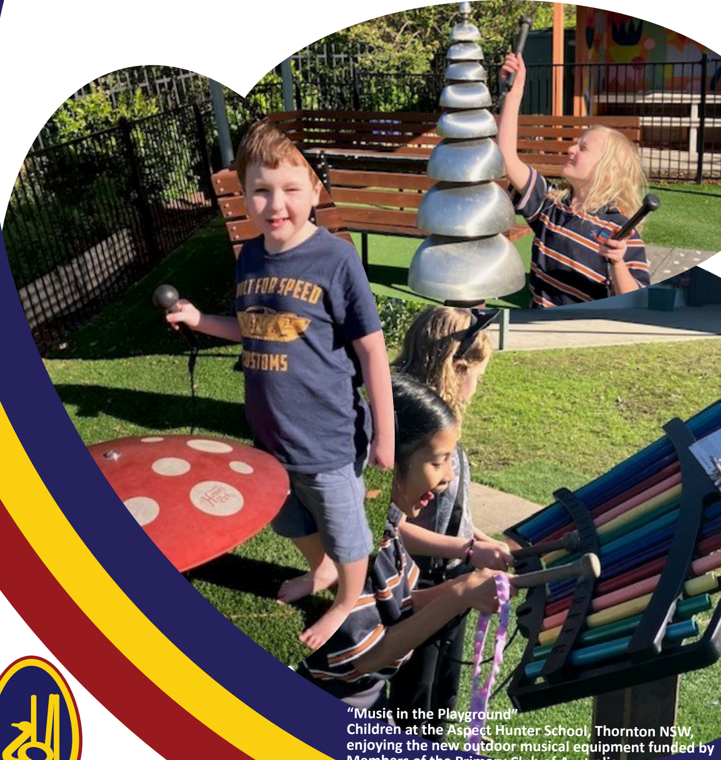
“Music in the Playground” Children at the Aspect Hunter School, Thornton NSW, enjoying the new outdoor musical equipment funded by Members of the Primary Club of Australia.