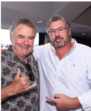
Primarians at work and play- members and guests enjoying the fun at our Killara golf day, and our North Sydney Oval cricket festival.