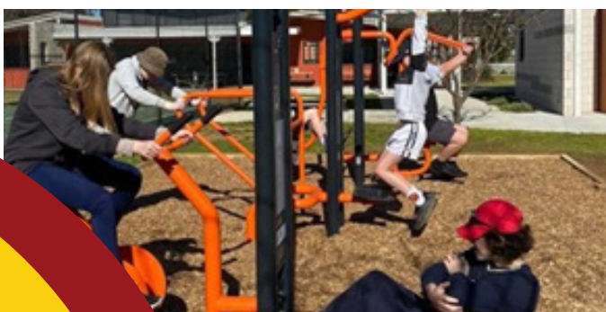
(Bottom left): Outdoor exercise equipment at Borinya School, Wangaratta VIC; (Top right) the multi-sensory room alight with flashing shapes and colours created by the students at Bear Cottage.