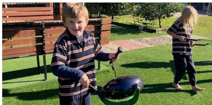
(Bottom left) So much fun the children at Aspect Hunter School are having, learning to create different sounds and music sensations; (Top right) Students reading, sharing and communicating in the new learning pods at Chrysalis WA.